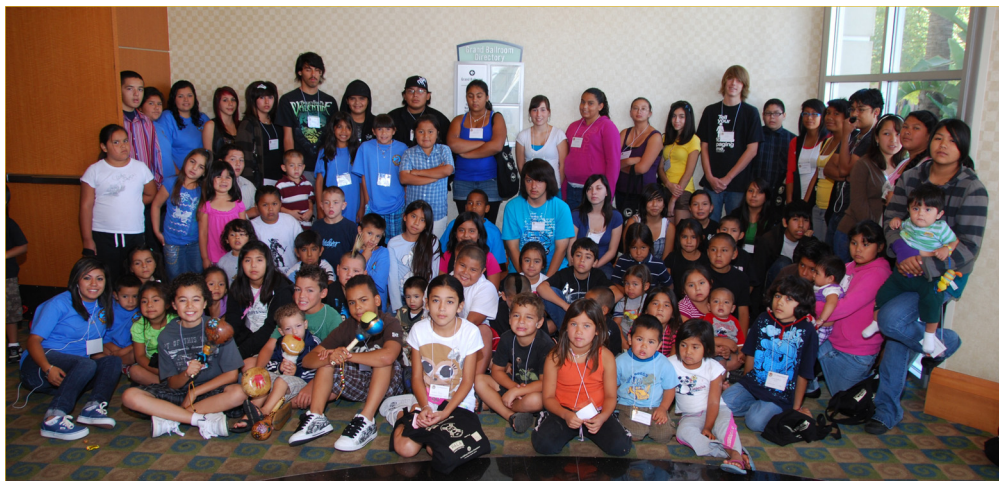
Working with you to improve our communities for In- dian children!