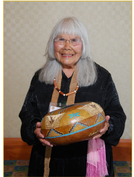
Celebrating your accom- plishments with you,