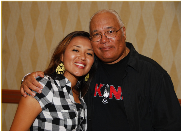
Sharing laughter with you, and