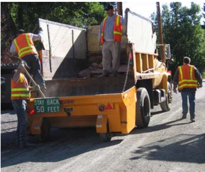
City of Bozeman Crew Distributing Cement