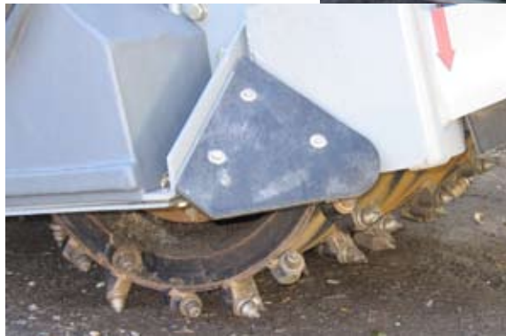
Close Up of Zip-It Attachment