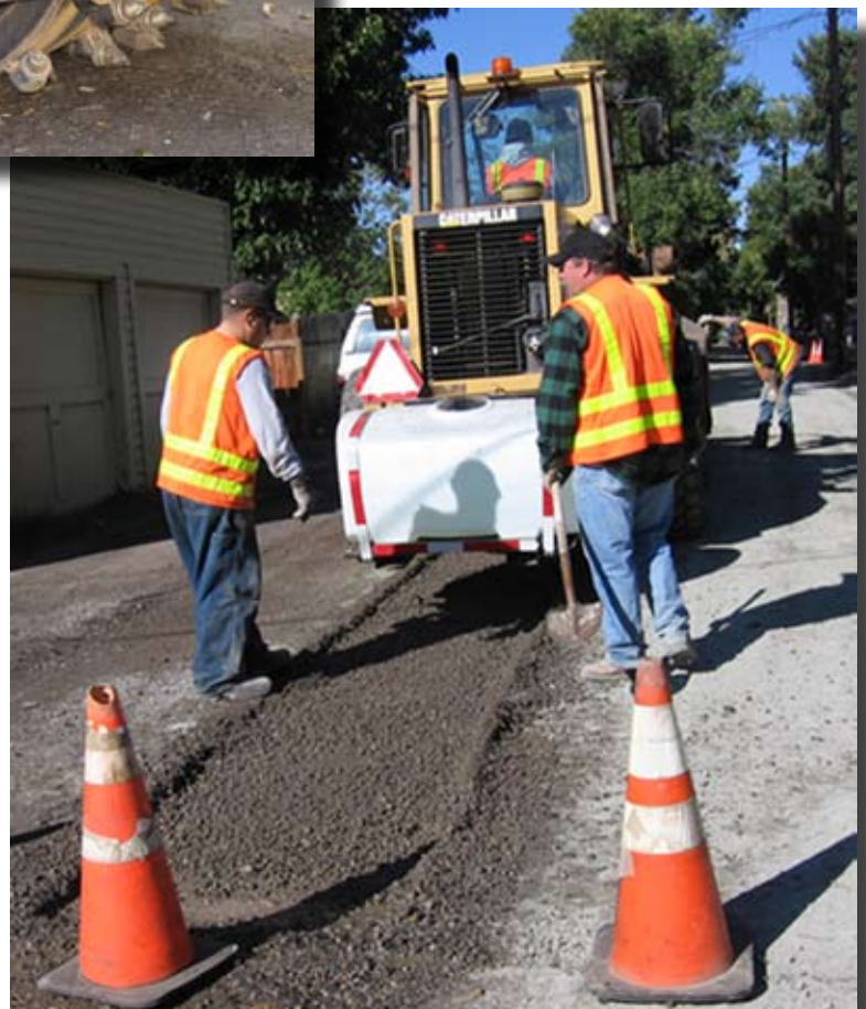
City of Bozeman Crew Zipping Alley