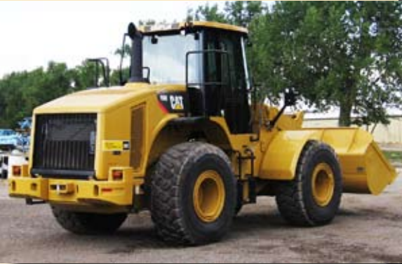
This 950H CAT front end loader was also available to workshop participants.